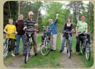
Left to right: Prayer room in Tabernacle; Queens day in Amsterdam; family time! 1st page: Amsterdam by day and night, family weekend